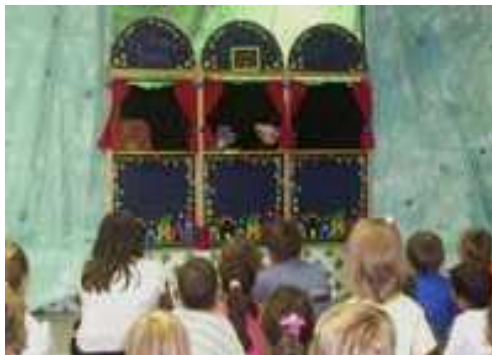
Herr Memorial Library, Mifflinburg, PA

The Families Learning Together Puppet Troupe Trio wrote several puppet shows, created the puppets, and performed the shows. Crafts, organized by the Puppet Troupe, followed each puppet show. The 2004 puppet shows included Baby Duck's New Friend , Baby Rattlesnake , Beaver's Lodge , and Rabbit's Last Race . The Troupe performed at the Beavertown, Herr Memorial, Lewisburg, McClure, Middleburg, and Selinsgrove Libraries, the Loving Hearts and Richfield Day Care Centers, and the Selinsgrove CareerLink. The Troupe also staffed an outreach event (face painting) at the West End Fair in Laurelton.