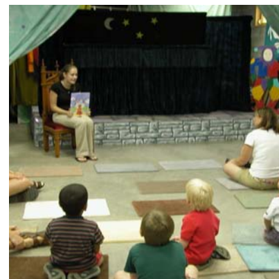
West End Library, Laurelton, PA