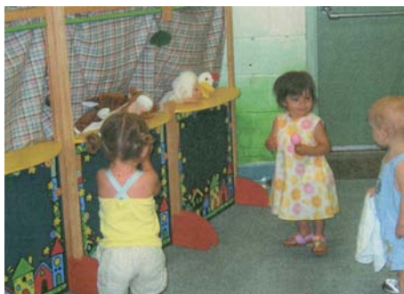
Selinsgrove Library, Selinsgrove, PA